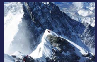
May 19th: Summit

No 8. Lee Den Hond: South African 09:10hrs NPT