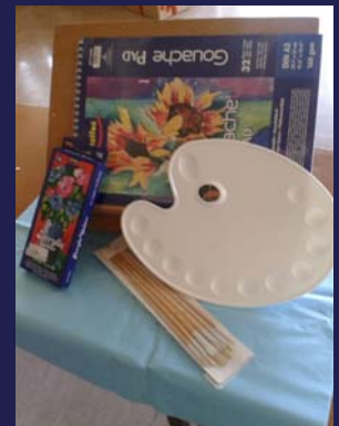
Some of the art prizes