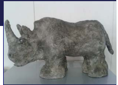
The Rhino by Sidney Benard