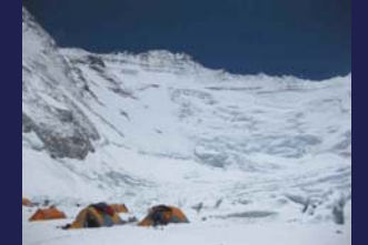
April 21st: Camp 2 check-in