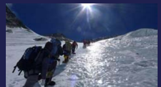
May 10th: It's time to climb