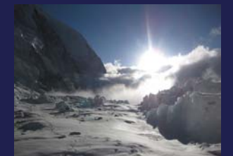
May 18th: Final Summit— "the push" is on