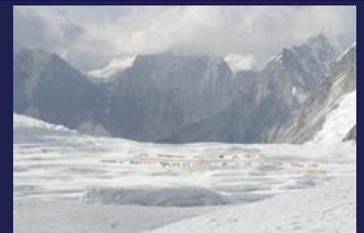
April 18th: Arrived at Camp 1