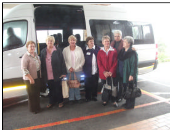
Ladies of the Branches gathering for their outing