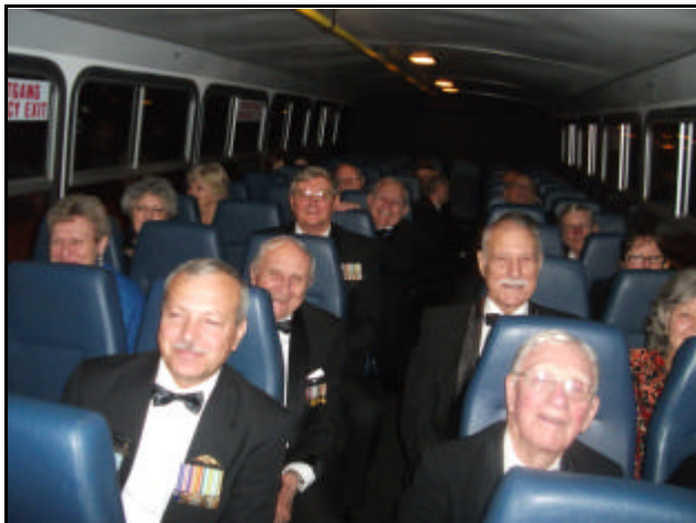
Jollity on the bus that transported the delegates to the Banquet on Saturday night