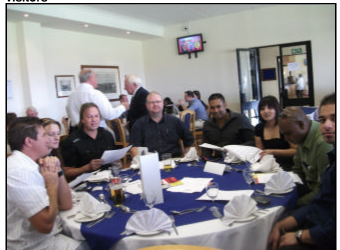
Nashua's guests seated at their table