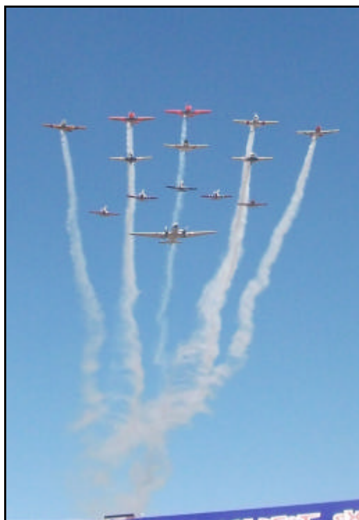
A spectacular fly-past at the Rand Air Show