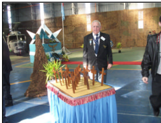
Planting of the cross for those of Johannesburg Branch called to Higher Service since last year