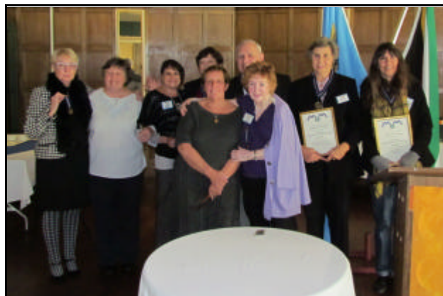
Founder members of the WAAFS who received Congress awards this year.

Last but not least was the most unexpected and for me a very proud moment when the original WAAFS received SAAFA medals and awards at the Congress this year. A testament that our work does not go unnoticed and is appreciated. The 'gals' were, for a change, speechless !!