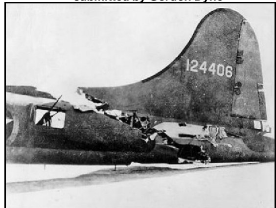
The damaged B-17